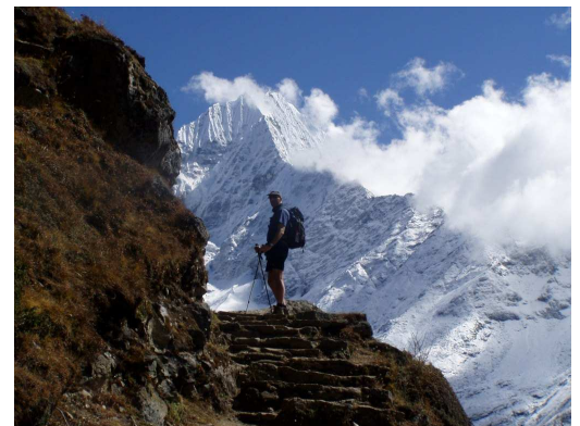
A classic view along the Everest trail and below, the fantastic view from Island Peak's ridgeline.

We employ a specialist climbing Sherpa for the Island Peak phase (in addition to