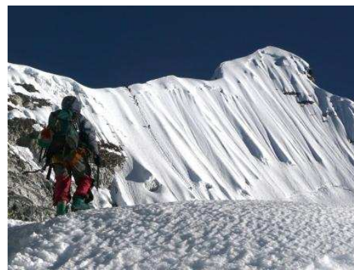
Trekking towards the base of Island Peak's hard packed snow wall. Island Peak is the highest peak visible

Whilst all this is going on, you will be under the watchful eye of a very experienced local Nepalese English speaking Guide (and possibly a UK Leader too) who will also manage the porters carrying your excess kit; you will only carry your daysack.