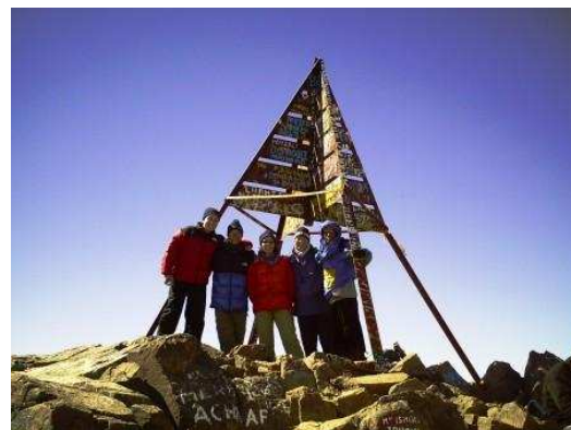
The Summit of Toubkal

You should have enough time in Marrakesh on your return to get out into the Medina and/or perhaps experience a Hammam.