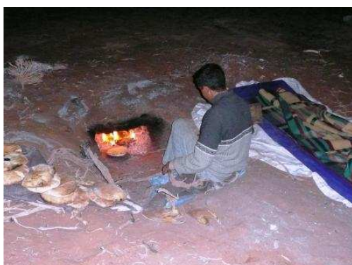
Ever made bread in the sand?