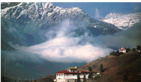
Paro's Rinpung Dzong

The mountain water in these traditional wooden built baths is heated by stones heated on fires for many hours and it is surprising just how fast the water gets hot! Don't be shy, have a go (you can wear swim wear); you may only be there once!