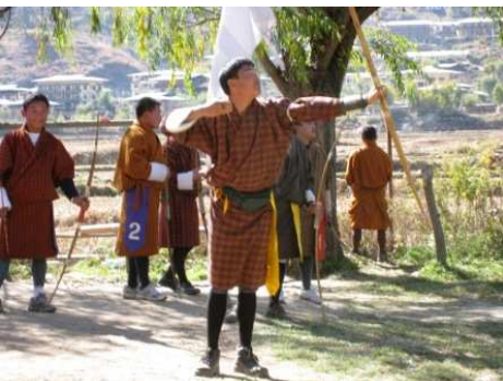
Bhutan is a Nation of enthusiastic archers

In general terms, you will eat meals in your hotels but there will be times when your Guide will take you out into classic Bhutanese restaurants. Lunch is normally taken in local restaurants. Don't forget that all food is an inclusive part of the trip (see page 3 for details).